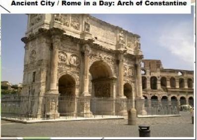
Ancient City / Rome in a Day: Arch of Constantine