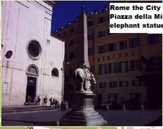
Rome the City / Wine Tours: Piazza della Minerva, by elephant statue