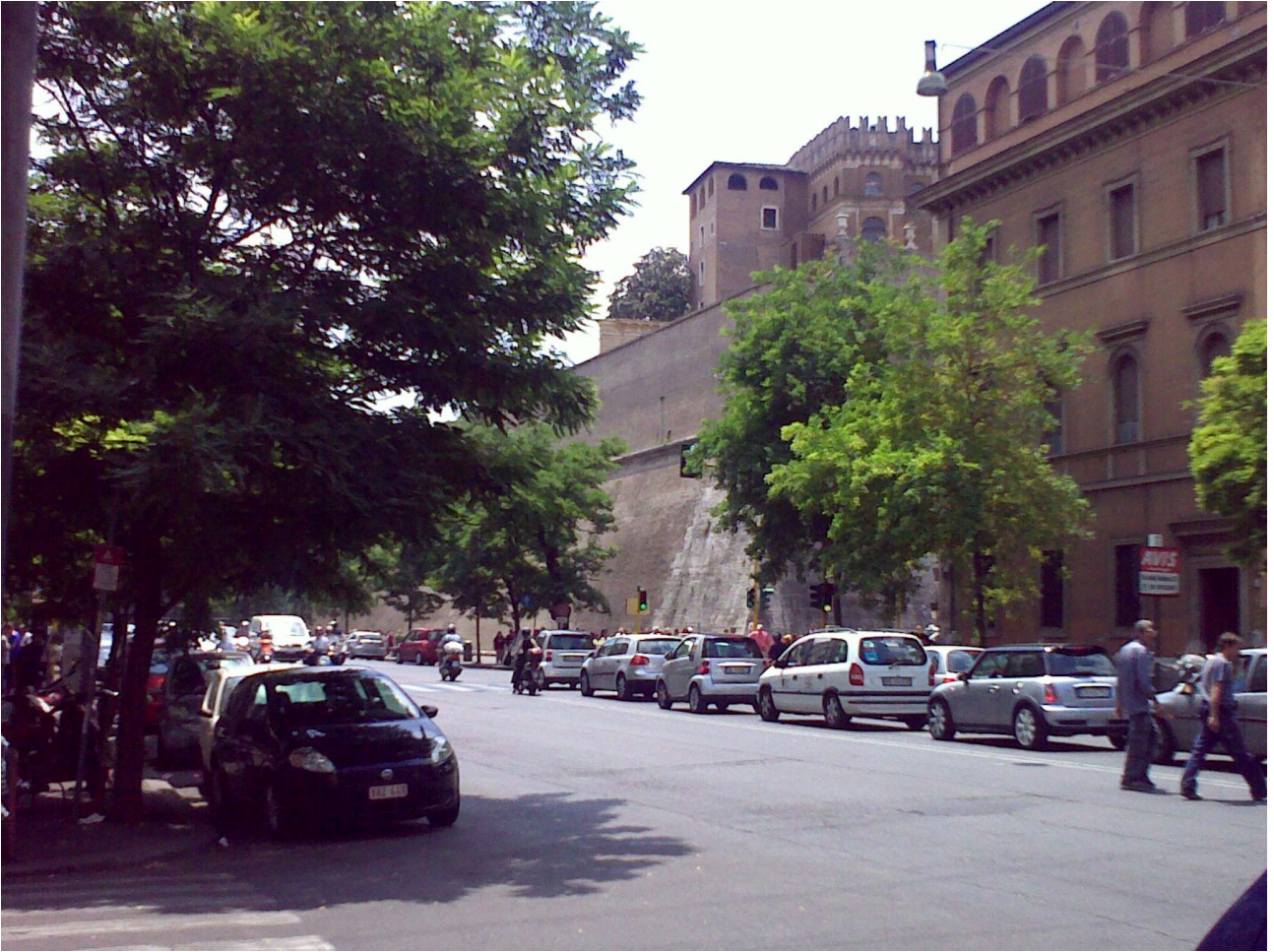
The view of the Vatican walls from our meeting point. The entrance to the Vatican Museums is just 200 metres up the road from here.