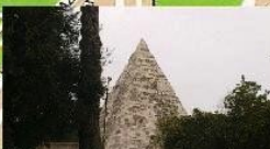
Ostia Antica: Piramide Metro Station, Café Piramide