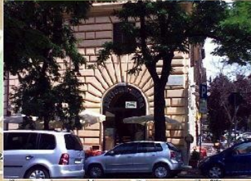
Vatican Tours: Café Antiche Mura, via Leone IV 51